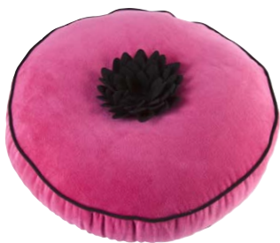
Stella pink velvet cushion with rose corsage detail 40 cm diameter CODE PNV058-05