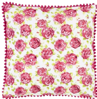
Petra cushion plain back with pompom trim 30 x 30 cm CODE RRS055-02