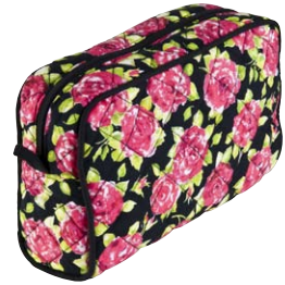
Molly make-up bag 20 x 13 x 7 cm CODE RRS083-01