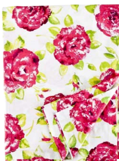
Tessa tablecloth 125 x 180 cm