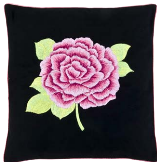
Ella embroidered cushion 45 x 45 cm CODE PNE044-01