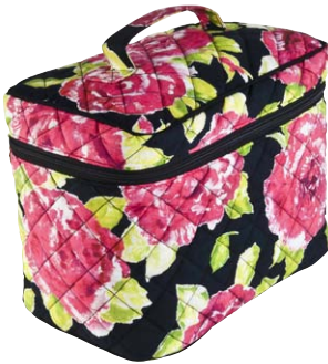
Vanessa vanity bag 25 x 15 x 9 cm CODE RRL087-01