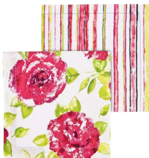
Natalie napkins 2 stripe, 2 floral 40 x 40 cm