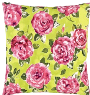
Polly cushion floral, plain lime back 45 x 45 cm