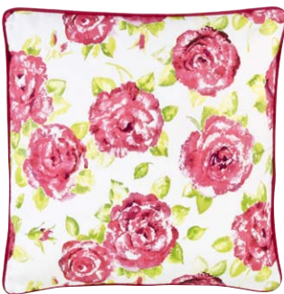
Polly cushion plain white back with piped edge 45 x 45 cm code RRL049-02