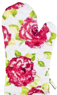
Bessie oven glove 33 x 17 cm