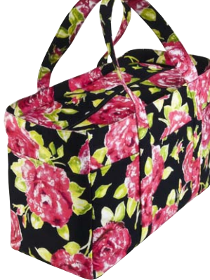
Tasha Tote bag 45 x 35 x 20 cm CODE RRL038-01