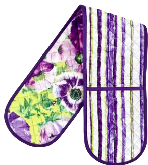
Bertha oven mitts 85 x 17 cm