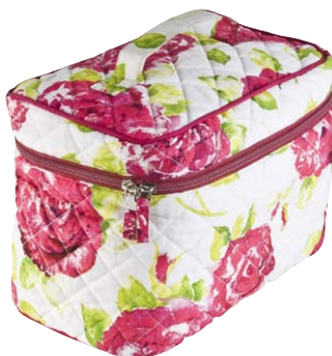
Vanessa vanity bag 25 x 15 x 9 cm CODE RRL088-02