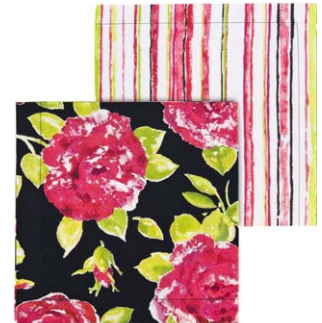
Natalie napkins 2 stripe, 2 floral 46 x 46 cm CODE RRL101-01