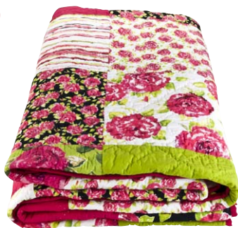
Aida multi patchwork quilted bedspread 215 x 245 cm CODE MPW075-05