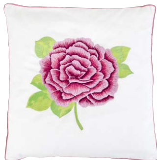
Ella embroidered cushion 45 x 45 cm CODE PNE045-02