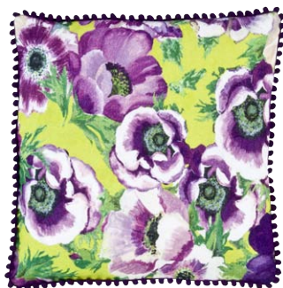
Petra cushion plain purple back with pompom trim 30 x 30 cm