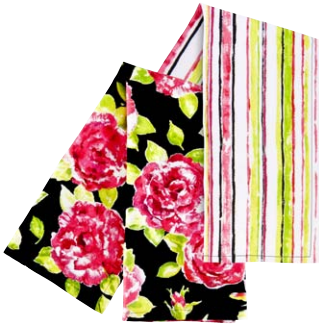
Tracy Tea Towels 1 stripe, 1 floral 50 x 70 cm CODE RRL023-01