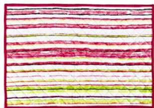
Mattie quilted placemat 35 x 50 cm