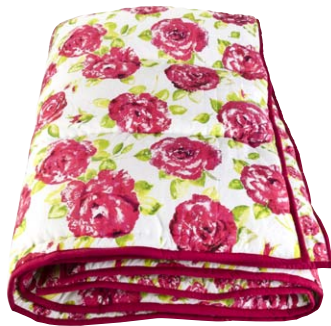
Queenie quilt bed cover 135 x 150 cm CODE RRL077-02