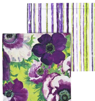
Natalie napkins 2 stripe, 2 floral 40 x 40 cm