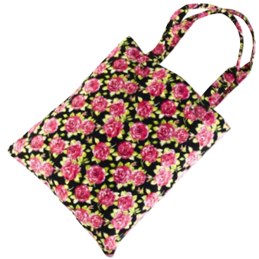
Lola Book bag 35 x 40 cm CODE RRS031-01