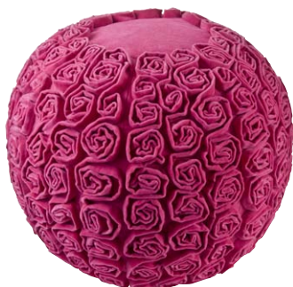
Rosa circular pouffe, velvet ruffles 65 cm diameter CODE PNV069-05