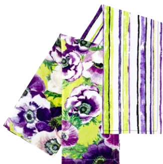
Tracy tea towels 1 stripe, 1 floral 50 x 70 cm