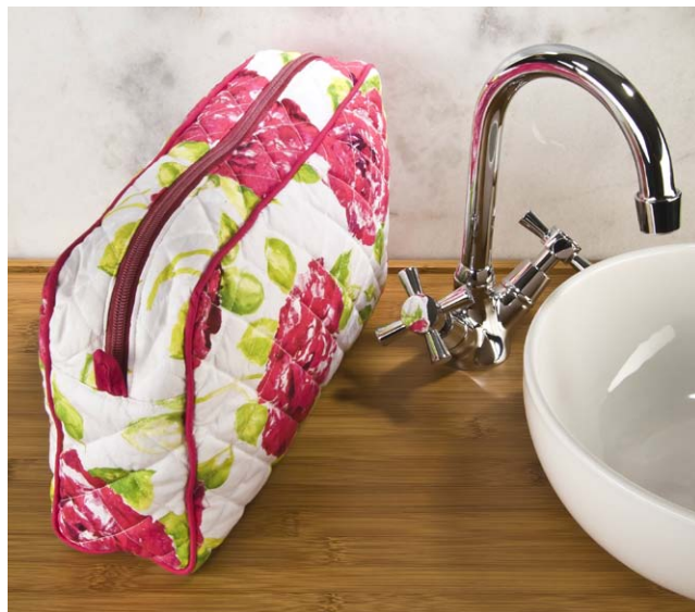
Harriet wash bag (left) 30 x 18 x 8 cm CODE RRL080-02