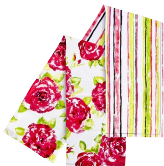
Tracy tea towels 1 stripe, 1 floral 50 x 70 cm