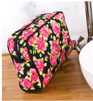
Harriet wash bag 30 x 18 x 8 cm CODE RRL079-01