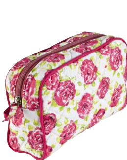
Molly make-up bag 20 x 13 x 7 cm CODE RRS084-02