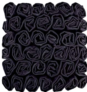
Rufus black velvet ruffle cushion (right) 40 x 40 cm CODE PNV062-01