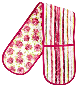
Bertha oven mitts 85 x 17 cm