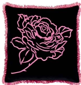
Clara black velvet embroidered cushion 45 x 45 cm CODE PNE066-01