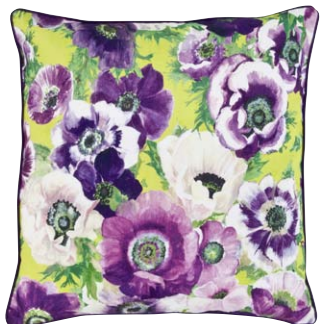
Polly cushion plain purple back with piped edge 45 x 45 cm