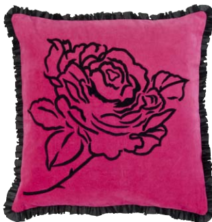
Clara pink velvet embroidered cushion 45 x 45 cm CODE PNE065-05